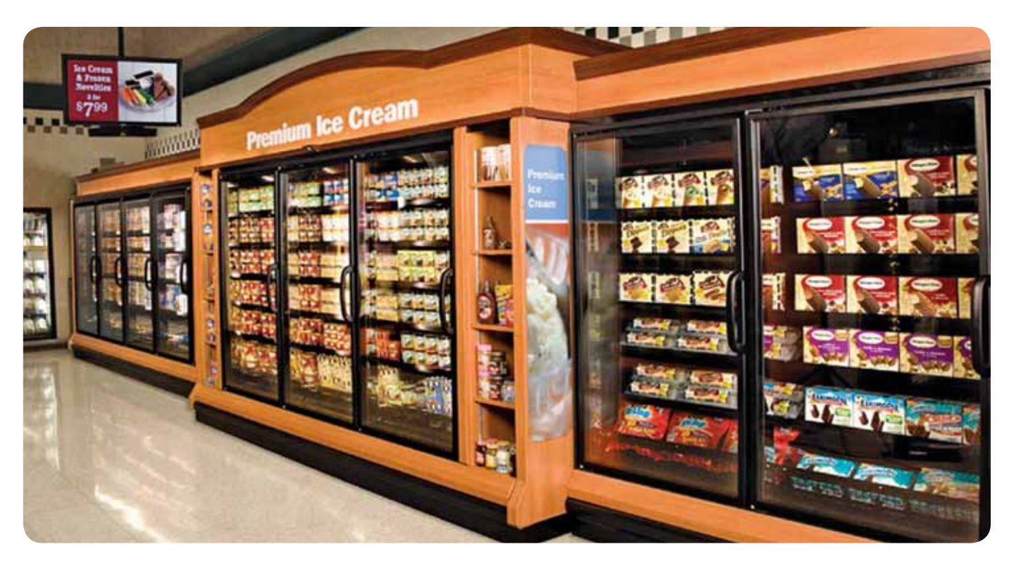
radiance Flat Laminates used in refrigerated retail fixtures