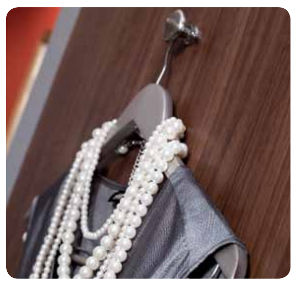
OMNOVA Paper Laminates used in retail fixtures