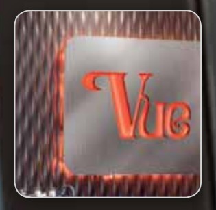
3 Dimensional Decorative Wall Surface